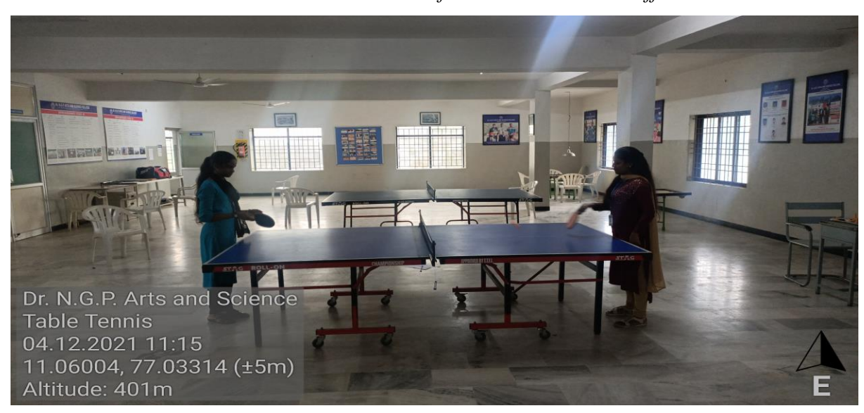
Indoor Facility: Relaxing Amenities within college premises