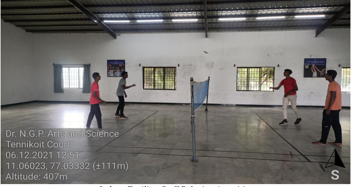
Indoor Facility: Staff Relaxing Amenities