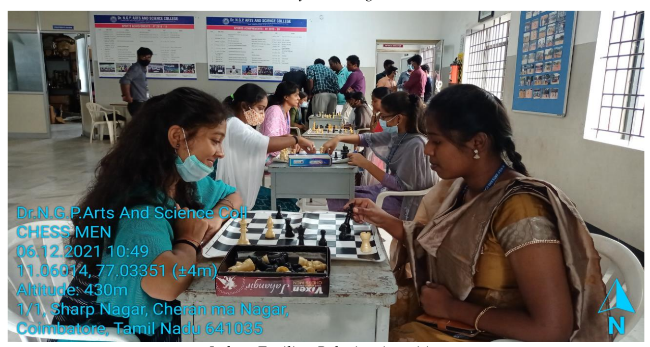
Indoor Facility: Relaxing Amenities