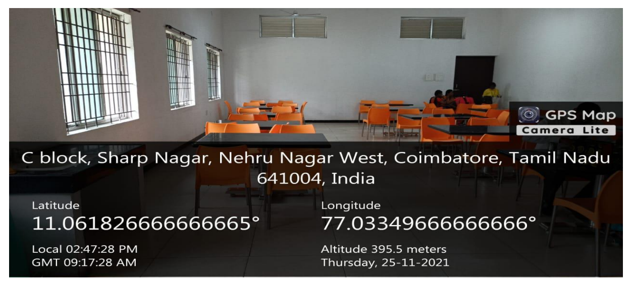
Common Dining Hall for Staff Members in the Canteen