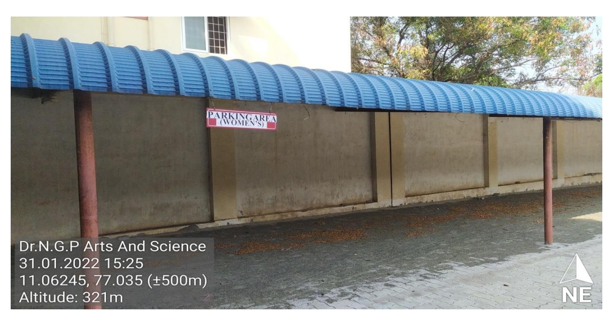
Exclusive parking area for women