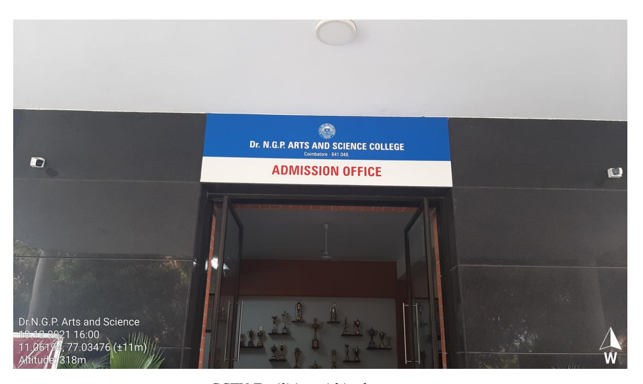
CCTV Facilities within the campus