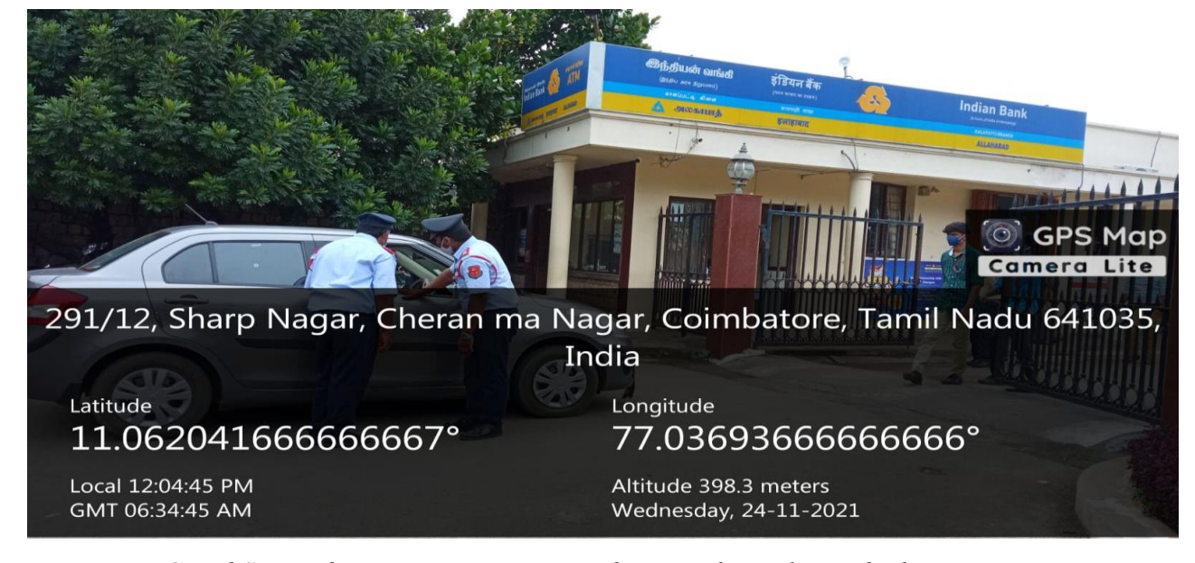
Gated Secured Entry point – Restricted Entry of People inside the campus