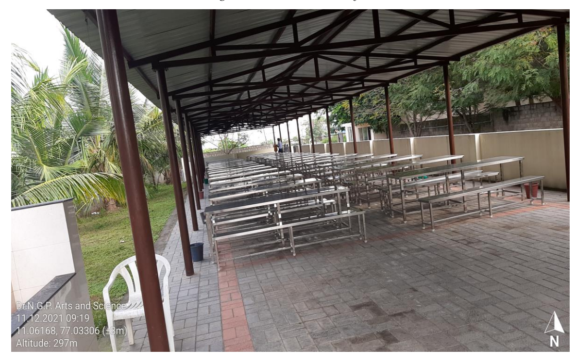
Common Dining Hall for Students within the campus