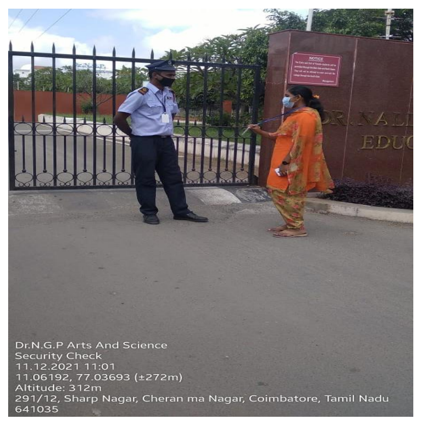
Mandatory Practice of Student wearing ID card inside the College Campus