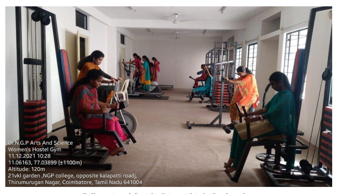
Fully equipped Gym facilities within Ladies hostel