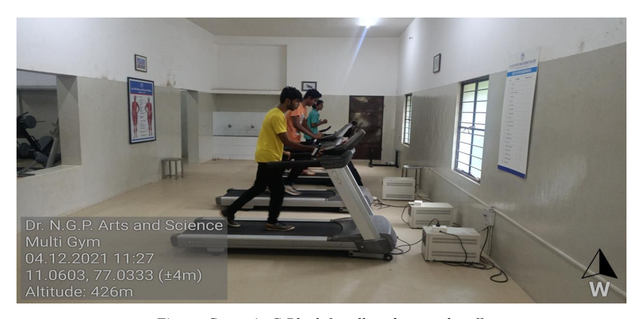
Fitness Centre in G Block for all students and staffs