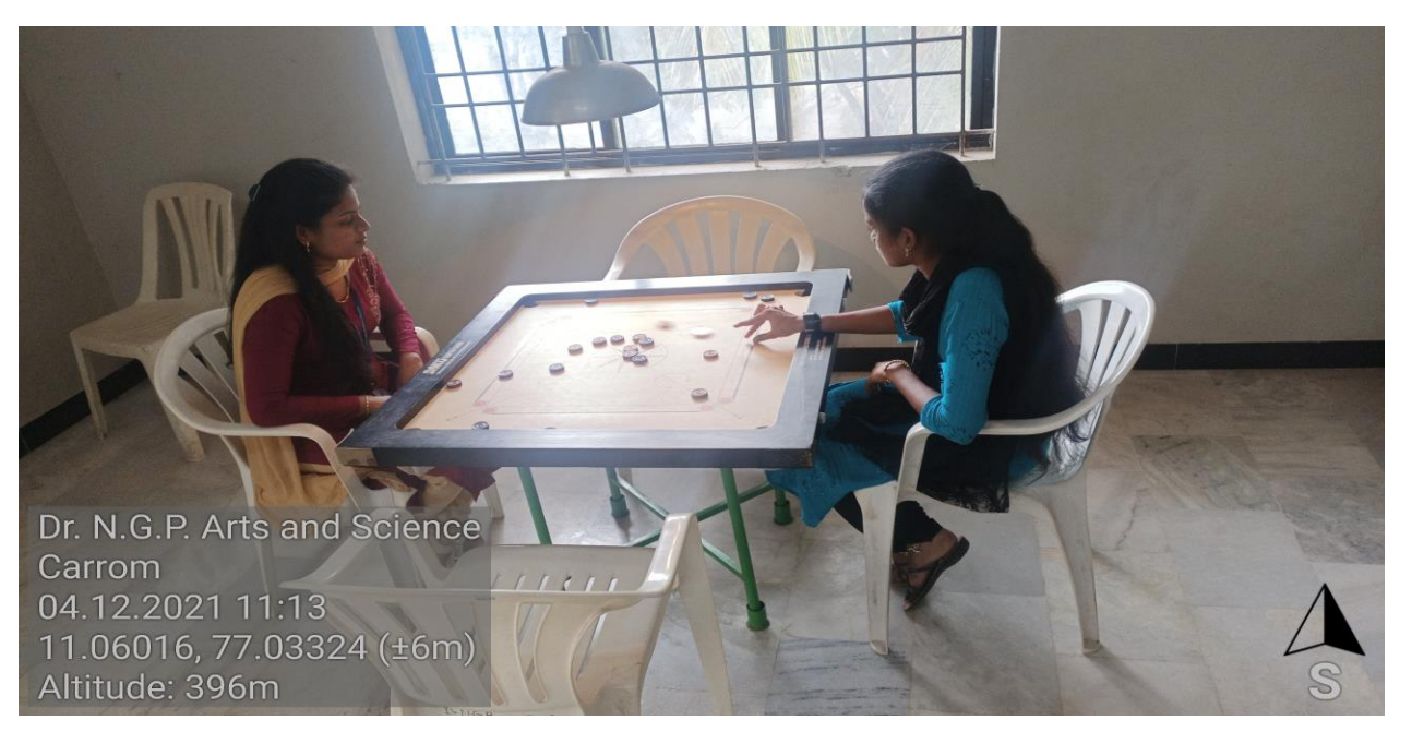
Indoor Facility: Relaxing Amenities