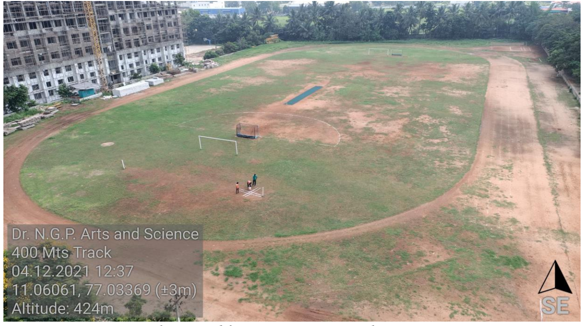
Playground for sports activities in the campus