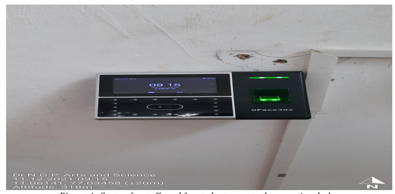
Biometric System for staffs and for students near to the reception desk