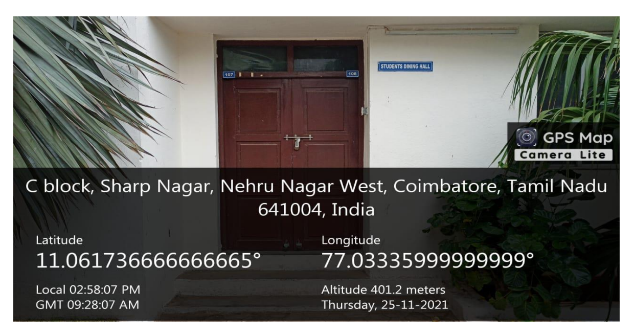
Student Dining Hall near NGP Conference Center