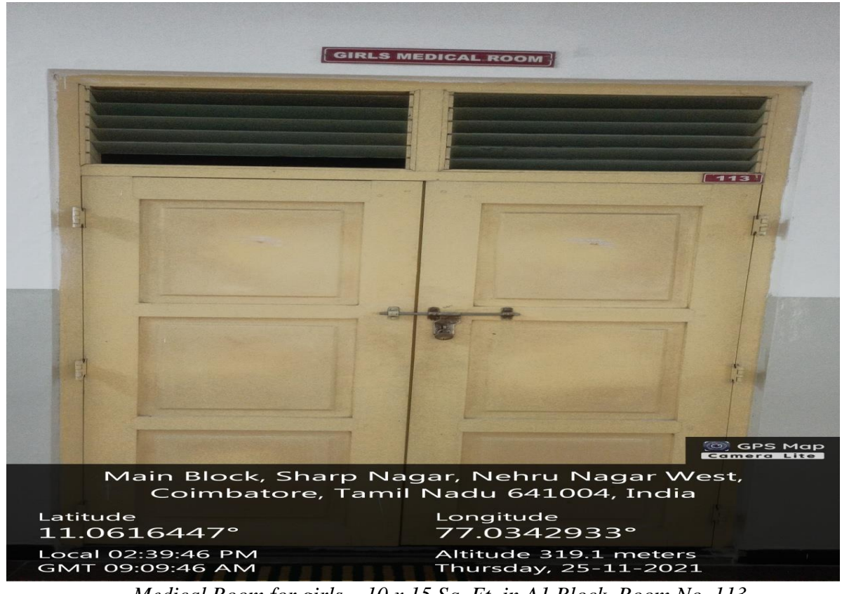
Medical Room for girls – 10 x 15 Sq. Ft. in A1 Block, Room No. 113