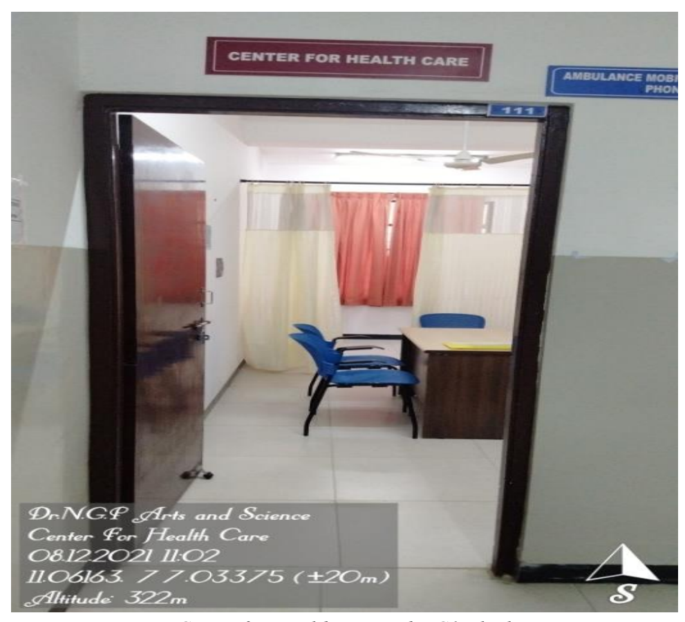
Center for Healthcare in the C1 Block