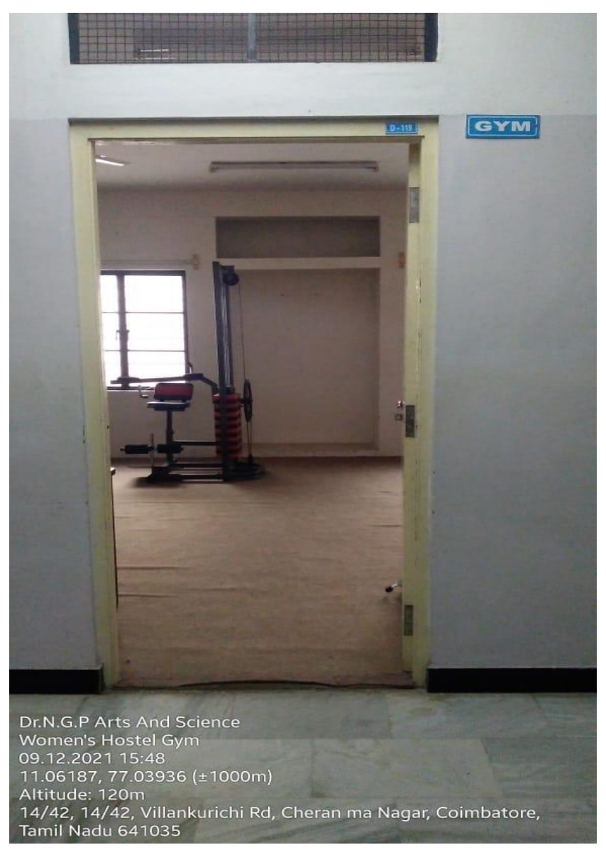
Exclusive Gym Facility in the Ladies Hostel